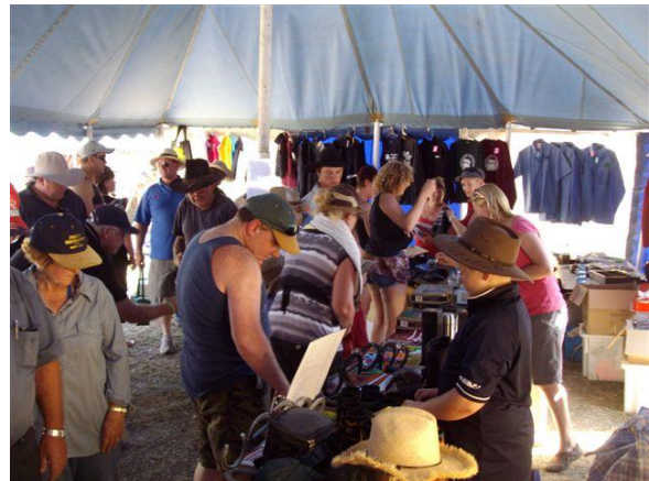
Happy patrons perusing the stock during the 2010 Get-Together.