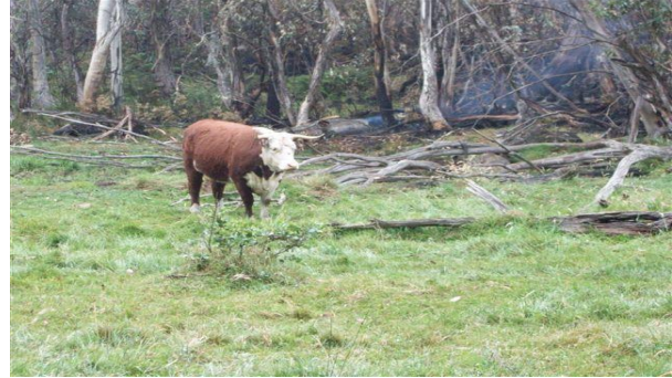
A content cow grazes next to the cool burning White Timber fire on the Dargo High Plains during the Black Saturday fires, February 10, 2010.

none of you boys are going farming till you have a trade."